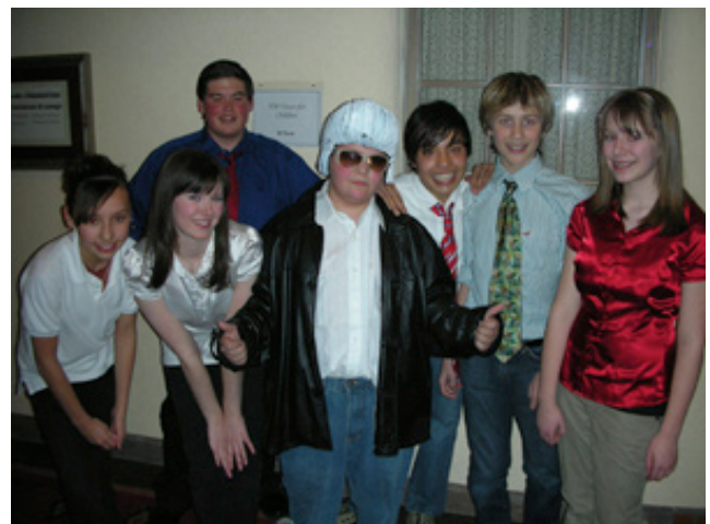
Youth performers lend their comic and vocal talents to the Roundhouse Comedy Revue , lampooning politics in New Mexico.

FY08 also saw the launch of our first annual Roundhouse Comedy Revue , performing in Santa Fe just after the legislative session opened. The comedy show featured skits and songs performed by several talented and very versatile young performers, and comedy sets by local actor/comedian Steven Michael Quezada. Several brave legislators also joined in the fun, taking parts in skits that lampooned New Mexico's unique brand of politics.